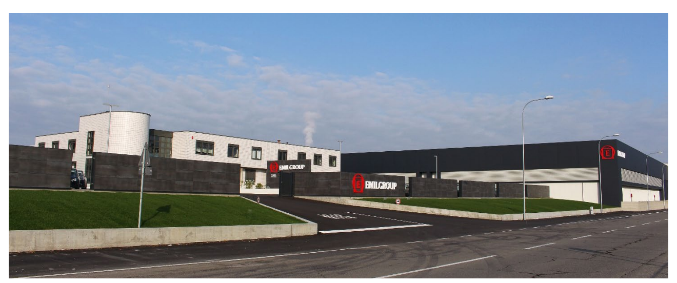
Emilceramica - Headquarter

Founded in 1961, Emilceramica is a company that in over 50 years of history has established itself as one of the benchmarks of the Italian ceramic industry. Its strategy of constant technological innovation and commercial openness has over time contributed to consolidating its leadership, positioning the company in the market segment defined as "top of the range". In its production facilities, with a capacity of over 9 million square metres per year, it designs, develops, produces and distributes porcelain stoneware tiles and slabs.